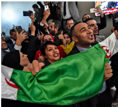
Poll dancer: Abdelmadjid Tebboune fans celebrate his victory in Algeria's 2019 elections.

The Algerian presidency said on Thursday that the country's presidential elections will happen in September, three months earlier than scheduled, giving no reason for the change. The current president, Abdelmadjid Tebboune, was elected in 2019, after year-long pro-democracy protests ended the two-decade rule of Abdelaziz Bouteflika. Tebboune's regime cracked down on the pro-democracy Hirak movements that set the stage for him by banning their demonstrations and arresting many of the activists. Thursday's