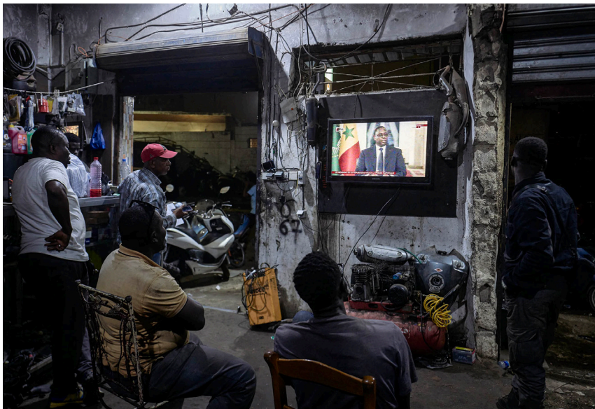
That's Sall, folks: President Macky Sall confirmed on 22 February that he will step down on 2 April, no matter how the elections play out. His reluctance to set a poll date or confirm his departure had set Senegal on edge.

“incidents related to political protests”).