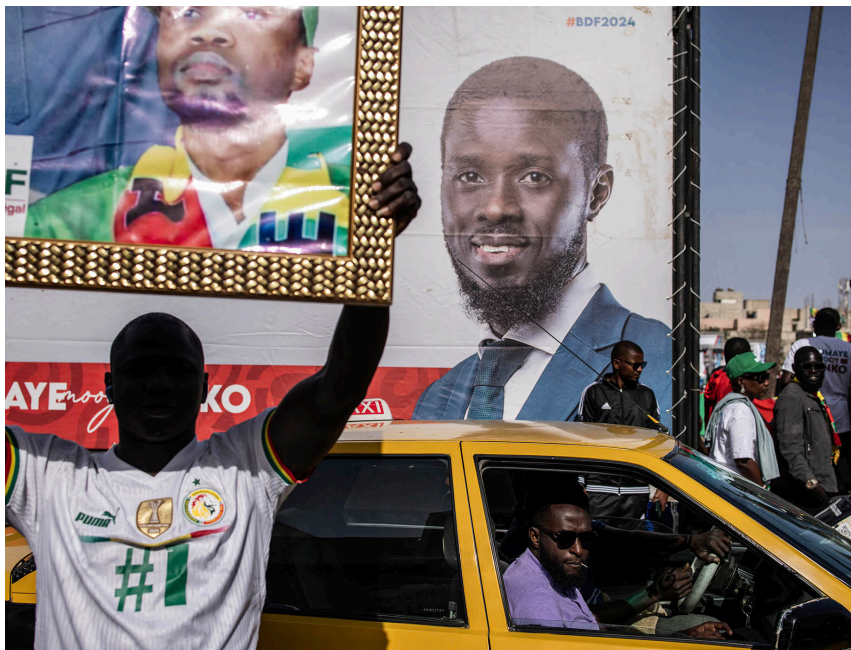
The young and the restless: A supporter of the coalition of anti-establishment candidates holds up a portrait in front of a banner of presidential candidate Bassirou Diomaye Faye in Dakar on March 10, 2024.