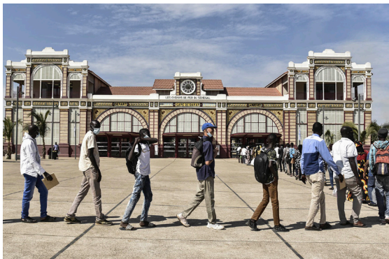
All aboard? Passengers queue in Dakar for tickets to travel on the regional express train, one of President Macky Sall's heralded infrastructure projects.

elections. It has witnessed multiple peaceful transfers of power.