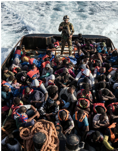
Peril on the sea: A soldier stands guard over 147 migrants rescued after their boat sank off Tripoli's coast.

The European Union has pledged to give Egyptian authorities $7.4-billion in a deal that includes the understanding that the North African country will tighten its borders, especially with Libya. The Libya-Egypt border is one of the main points used by people making the journey from Africa to Europe via the Mediterranean. Last year, the EU agreed to help Tunisia with its budget, in a $1.3-billion deal that included $160-million for curbing migration. The bloc also funds the Libyan coast guard to intercept migrants in the Mediterranean.