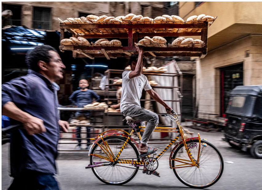
Carb cycling: A delivery biker balances a tray of freshly baked bread on his head as he navigates the al-Darb al-Ahmar district in Cairo.

In this austere environment, content on economical recipes has garnered thousands of views on social media. Most of it is on cheaper alternatives to animal