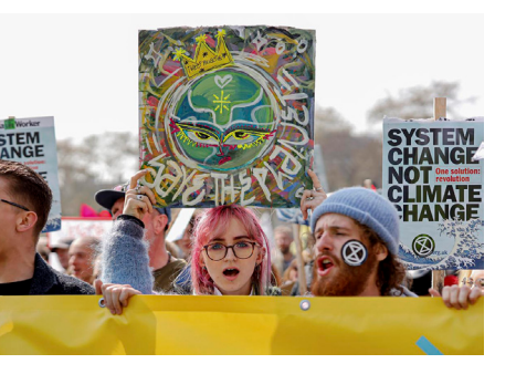
Talk is cheap: In 2009, wealthy nations pledged billions to help Africa adapt to the climate change they caused. We're still waiting.

inadequate," says a statement adopted by African delegates in Cabo Verde.