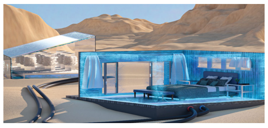
Cool storey: Scientists in Saudi Arabia have demonstrated an inexpensive heat absorption system that could cool buildings without using electricity.

A 2020 study by Cornell University showed that the perfect indoor temperature for work or classroom productivity is a relatively balmy 25°C. As many on the continent will attest, that's a fair few degrees cooler than citizens of African countries might be used to.